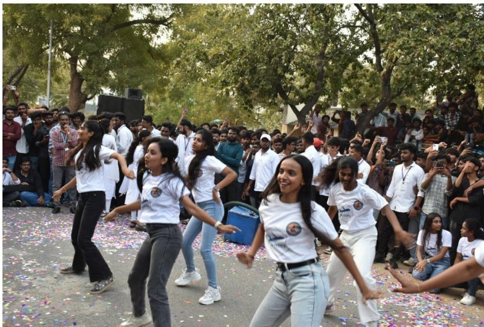
Dancers setting the stage on fire with an unforgettable flashmob performance!