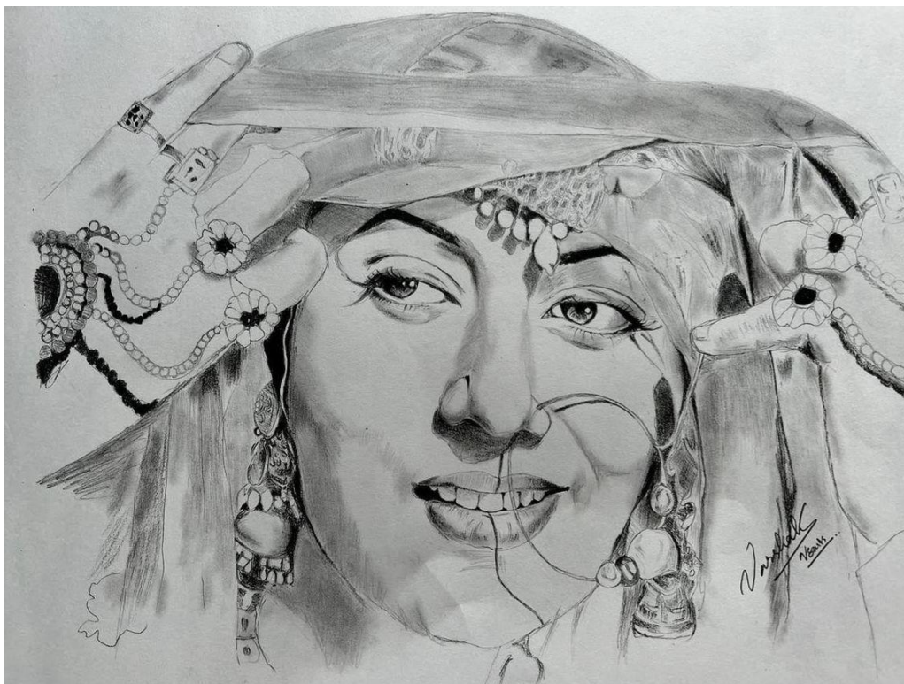
Sketch by a student from MDF club presented in Virtual vision