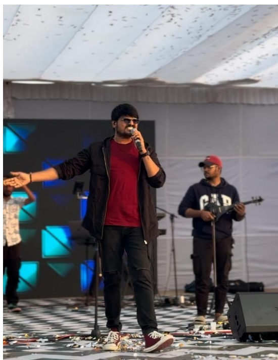
Vocalist Interacting with students