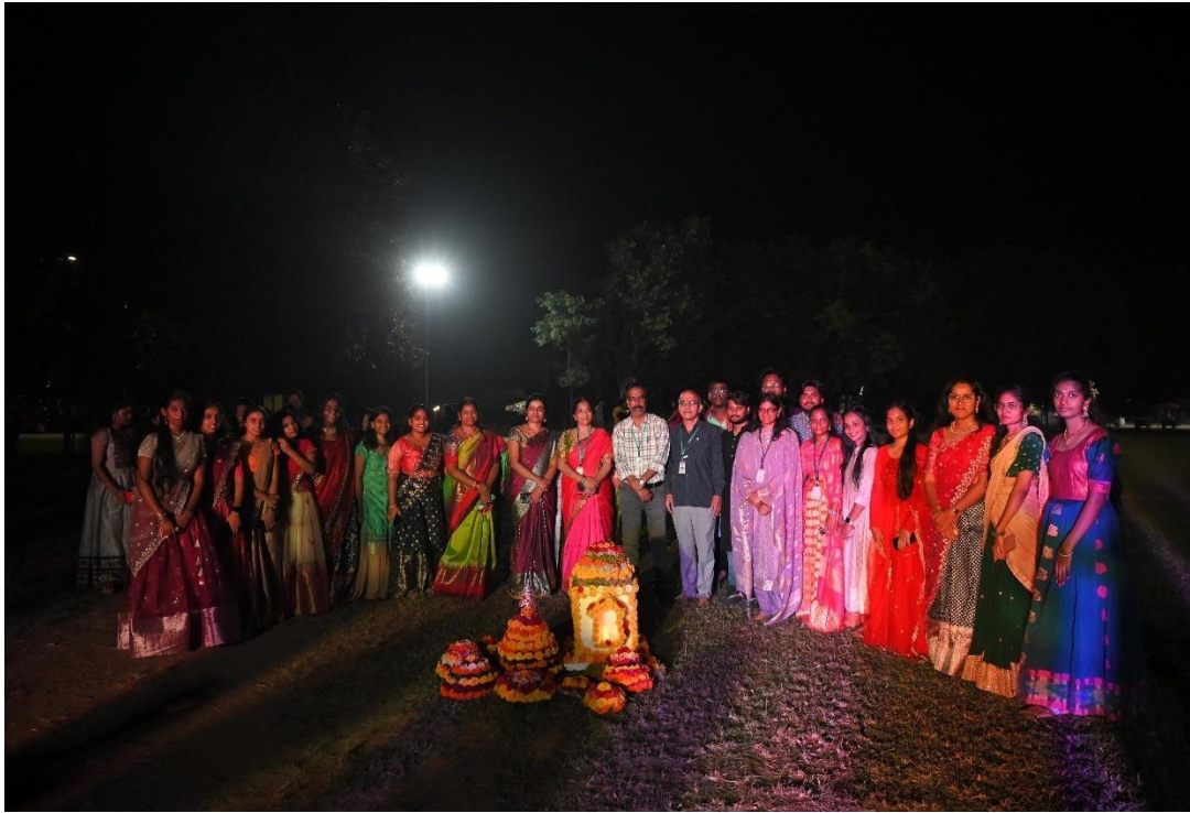
Students with faculty incharges