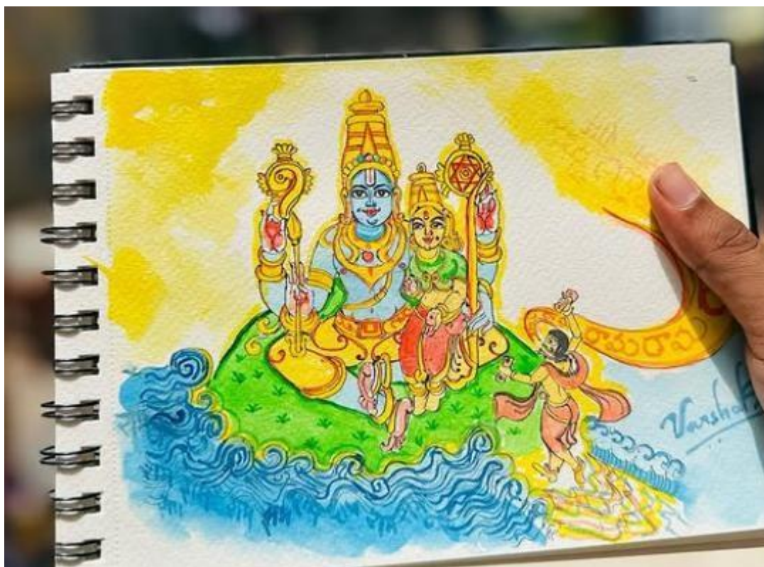
Painting of lord Vishnu and Lakshmi Devi