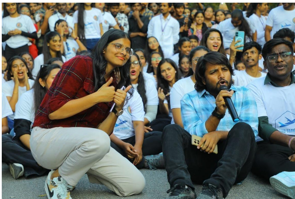
Audience grooving along with the performer