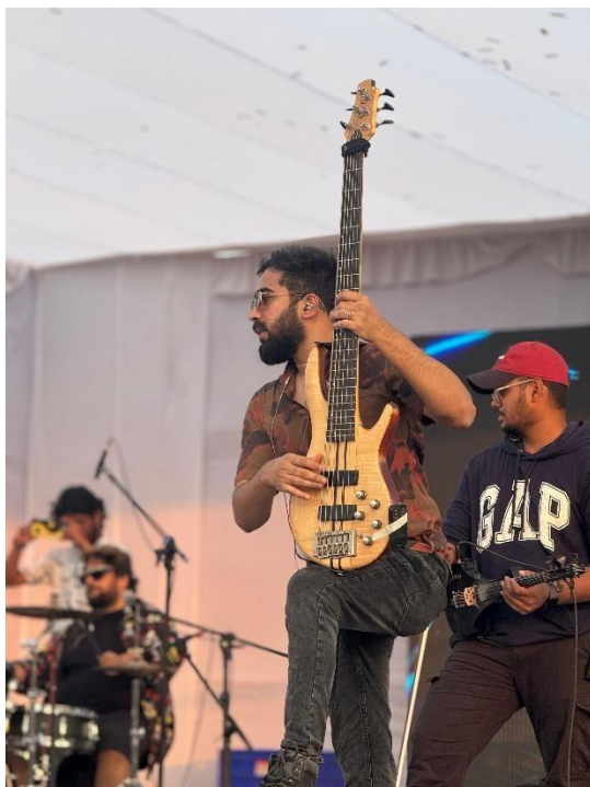
Guitarist from Band Akshar