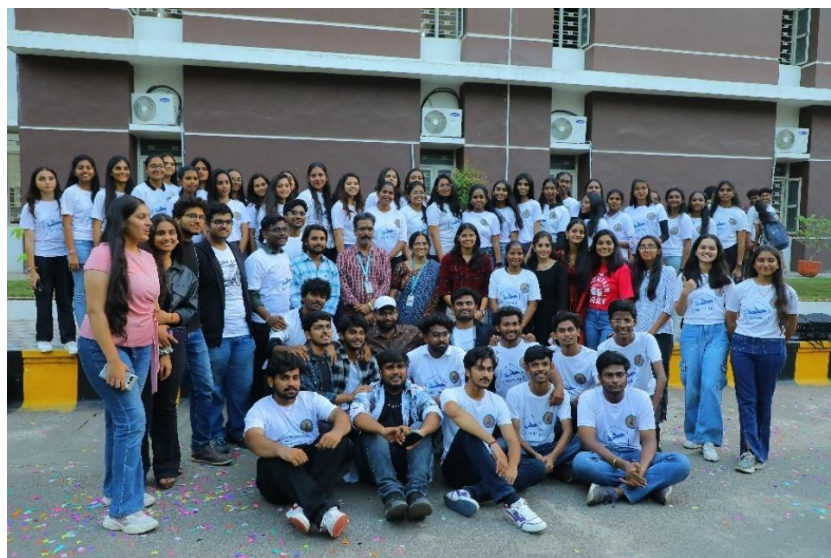
MDF club performers with respective Dean and Assoc. Dean