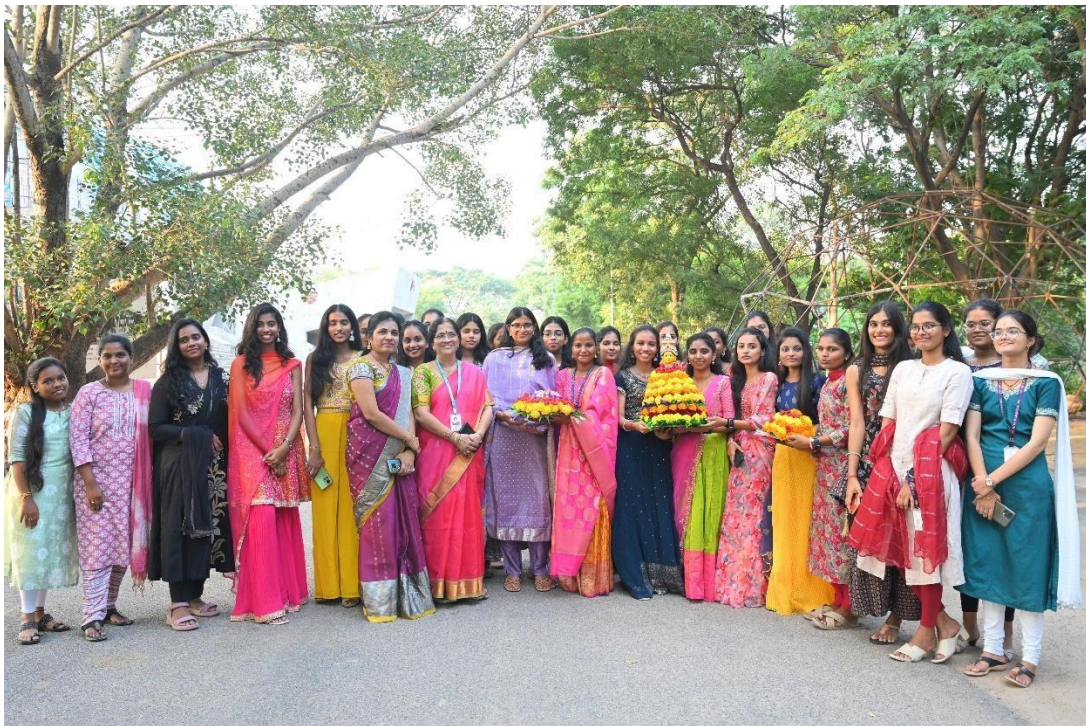
Students and faculty holding sacred bathukamma