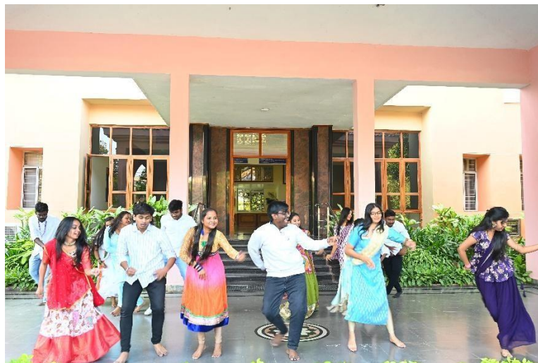
(Dance performance which included national dances from various states in India)