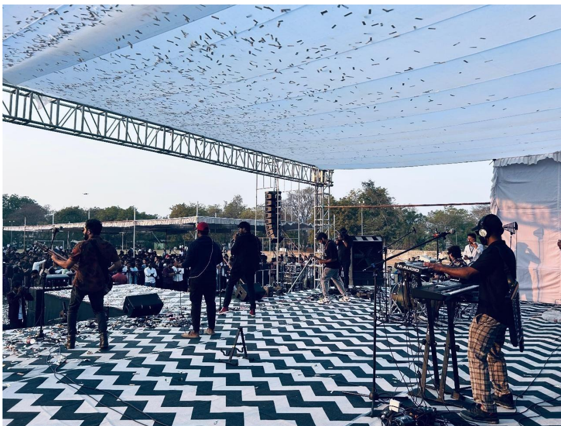
(Band Akshar Performing Live)