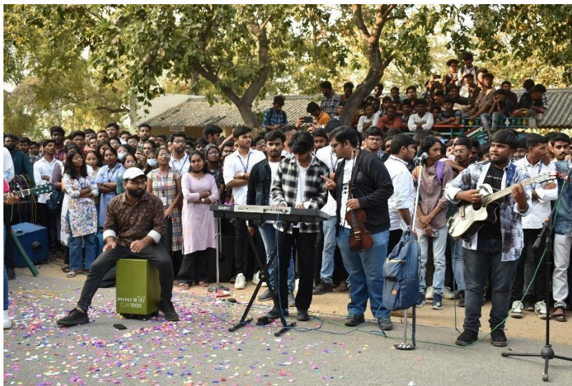
Band Alaap performing in the flashmob

Surprise and excitement gripped the campus when MDF Club executed an unannounced flashmob at a central gathering space. The beats of high-energy music started, and within moments, students jumped into a synchronized performance, leaving bystanders amazed. The flashmob combined various dance styles, from hip-hop to freestyle contemporary, symbolizing the dynamic spirit of the youth. The overwhelming audience participation made it an unforgettable experience, proving that art has the power to bring people together in the most unexpected moments.