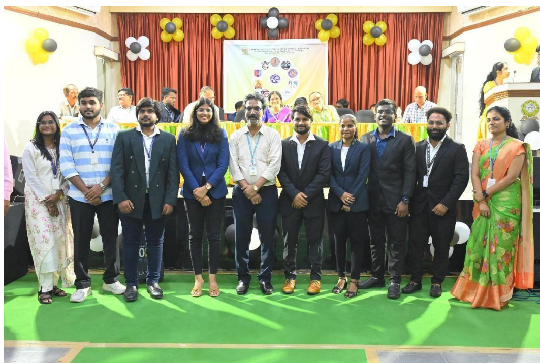
(MDF club faculty incharges with Executive body)