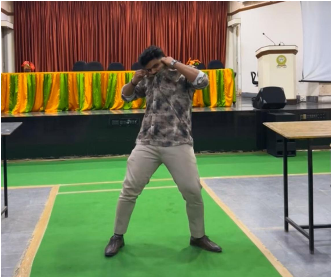
Freestyle dance performance

Freestyle Dance night was a high-energy competition where participants showcased spontaneous creativity. Unlike choreographed routines, dancers improvised moves to surprise tracks across genres. The event featured thrilling 1v1 dance battles, where performers displayed agility, stage presence, and adaptability. Some impressed with fluid body waves, while others stunned with acrobatics and power moves. The highlight was the audience's enthusiastic support, cheering on daring and unique performances. The event celebrated individuality, self-expression, and raw talent, proving that dance is not just technique but a powerful storytelling medium. It was a night of boundless energy, creativity, and artistic freedom.