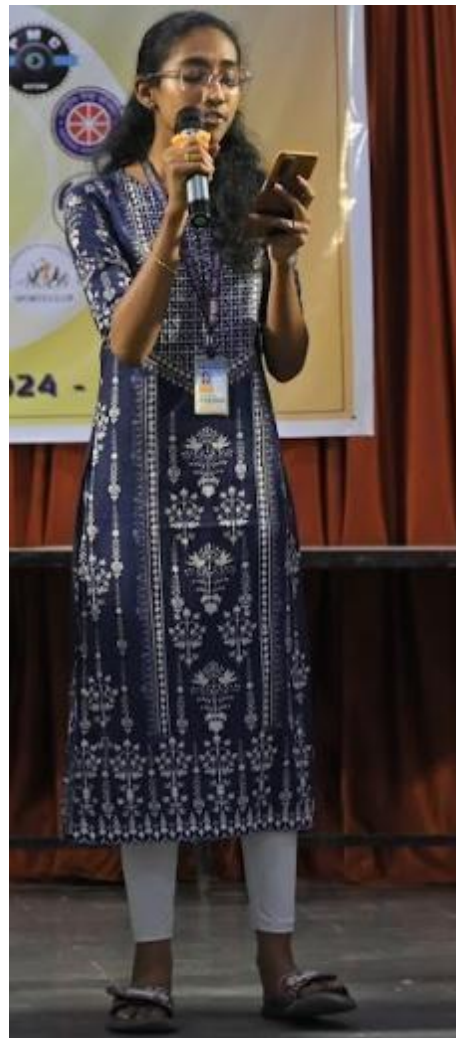
(Students showcasing their talent)