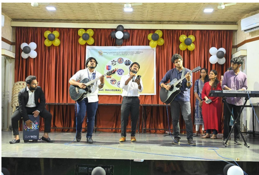
(MDF Band crew performing live)