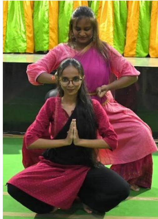
(Students performing classical dances)