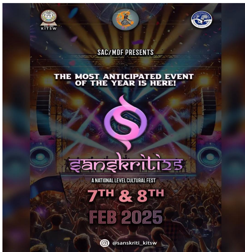
Sanskriti 25' Dates poster

Sanskriti, the flagship cultural festival of KITSW, is a grand celebration of artistic talent, creativity, and collaboration, organized by the Music, Dance, and Fine Arts (MDF) Club under the Student Activity Centre (SAC). The festival blends traditional and contemporary performances, featuring a diverse range of events including dance, music, theater, painting, and literature. The 2025 edition was inaugurated by esteemed guests, including Telugu film director Venky Atluri and senior faculty members, setting the stage for a vibrant two-day spectacle. The first day, themed Western Beats , was an electrifying showcase of solo and group performances in singing, instrumental music, and dance, culminating in a high-energy live concert by AKSHAR. The second day embraced Traditional Beats , immersing participants in folk and classical performances, followed by a mesmerizing college band show by Alaap. The festival concluded with an unforgettable DJ night featuring DJ Pritvi Sai, leaving the audience in high spirits. Sanskriti not only provided students with a platform to exhibit their talents but also fostered teamwork, leadership, and a deep sense of cultural appreciation, making it one of the most cherished events of the academic year.