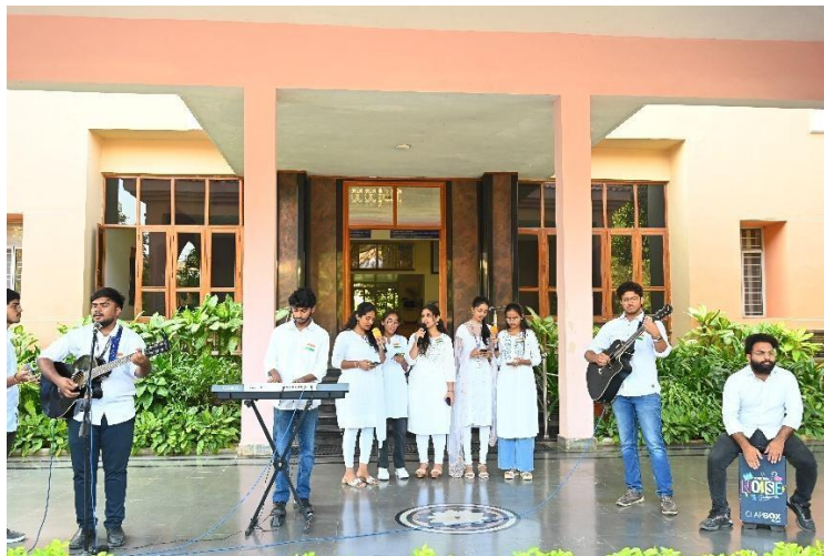
(Band Alaap's performance with patriotic theme)

Patriotism reached new heights during the Republic Day celebrations organized by MDF Club. The event featured a powerful dance drama , depicting India's transition from colonial rule to a thriving democracy. The performers left the audience emotional as they relived the struggles and triumphs of the nation. A mesmerizing orchestra performance followed, blending classical Indian music with modern symphonies, representing the harmony of tradition and progress. In addition, a poetry recital competition was held, where students penned verses on unity, freedom, and democracy, adding a personal touch to the celebration. The event emphasized the role of art in national consciousness, inspiring students to be responsible citizens.