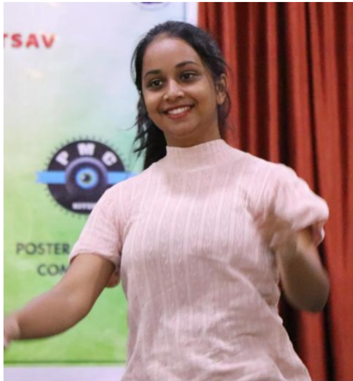
Student performing western style dance

Western Dance night was an electrifying showcase of contemporary, jazz, and hip-hop styles, leaving the audience in awe. Performers displayed impeccable coordination, dynamic formations, and high-energy routines. Hip-hop dancers impressed with their popping and locking moves, while contemporary dancers expressed deep emotions through fluid motion. The jazz segment brought playful vibrancy with fast-paced choreography. A thrilling group battle saw dancers fusing styles, creating an explosive performance. The pulsating beats and energetic crowd engagement made the event unforgettable. It was a celebration of modern dance forms, inspiring students to express themselves fearlessly through rhythm and movement.