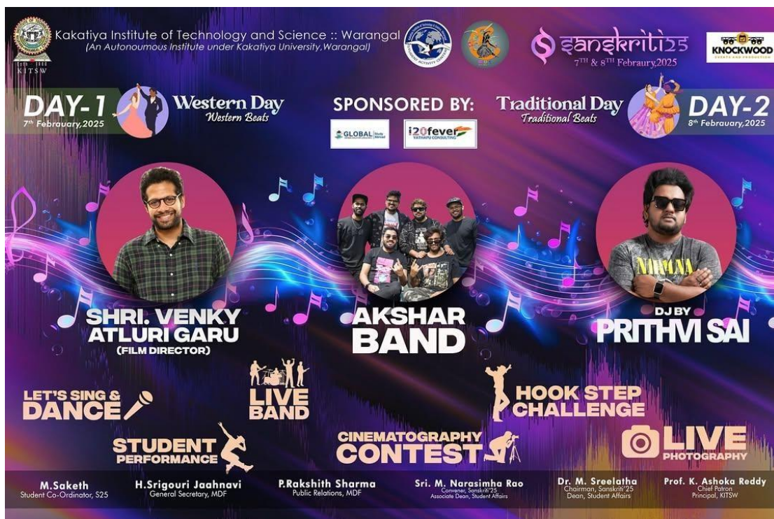
DAY-1 DAY-2 Artist Poster