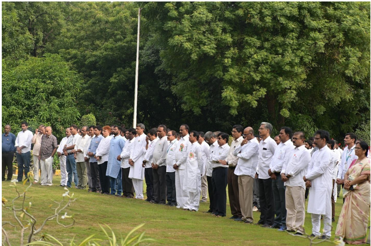
Faculty members gathered during the flag hoisting ceremony, celebrating unity and patriotism.

The MDF Club set the stage for an awe-inspiring Independence Day celebration, where the air was thick with patriotism and enthusiasm. The event began with a soulful invocation, setting a reverent tone for the day. The highlight of the event was a fusion performance, where classical Bharatanatyam and contemporary dance seamlessly intertwined, showcasing the journey of India's freedom struggle. The crowd was left spellbound as the dancers moved in sync, narrating tales of bravery and sacrifice. A patriotic musical ensemble followed, filling the air with melodies that resonated with the spirit of the nation. The grand finale saw the dancers form a living tricolor, bringing the audience to their feet in applause. Through these performances, students not only displayed their artistic talents but also deepened their understanding of national pride and unity.